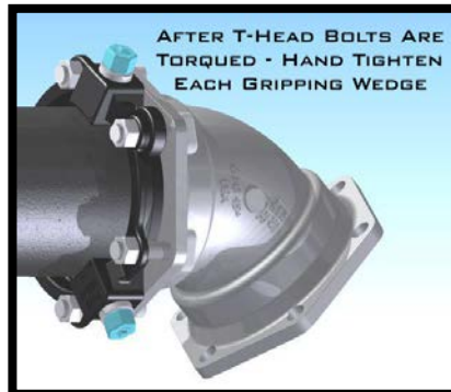
Steps: 6 and 7