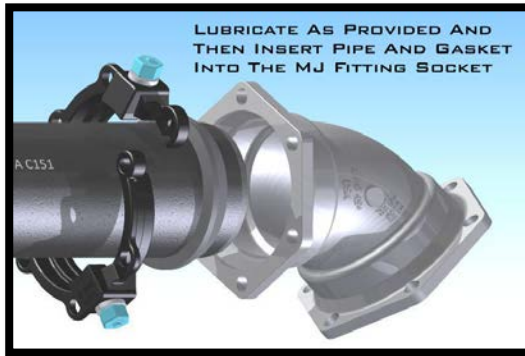
Steps: 1 and 2